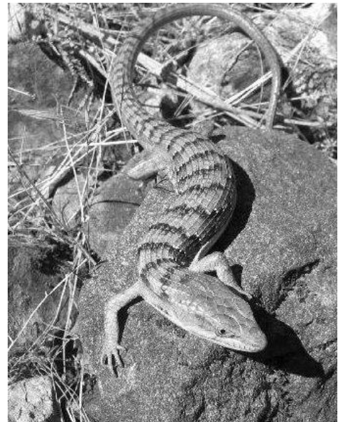
Even a young alligator lizard is more than willing to bite down on the hand that captures him.