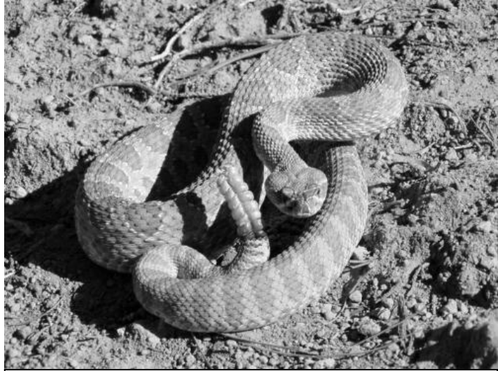
Prairie rattlesnake indicating it means business. Photographers cautioned to not get too close.

The Bulgrins and Mahers left after dinner for Socorro and rooms in a motel and later cruised the road south of San Antonio. They returned the next morning with five large and beautiful Great Plains toads and four nice Couch's spadefoots they'd collected on their cruising expedition. After passing out toads to those who promised to love and care for them forever, we divided up to hit the sands for more morning collecting. Brown's Bunch headed for the Ladron Peak area at the northwest tip of the Sevilleta Refuge and the others remained near the LTER for herping. The Ladron Peak trip was quite scenic and Del and Lynn found two small collared lizards near the west base of the peak. It did take us a while to get to that side of the mountain, even though the road was dry, a bit unexpected given the severity of the Saturday afternoon rainstorm at LTER. Not much rain had fallen in the north part of the refuge. We managed to reach an old ranch house near the 1991 campsite of NMHS on the west side of Ladron Peak. Del saw 2 more collared lizards, Lynn saw a pair of fence lizards and Garth and Ted took photos and tried to leave an old apricot tree near the house alone. We zoomed back to LTER for lunch and more photos of critters, more notes on who saw just what and how many, and then we all managed to pack up and leave the place by about 5 PM and head home.