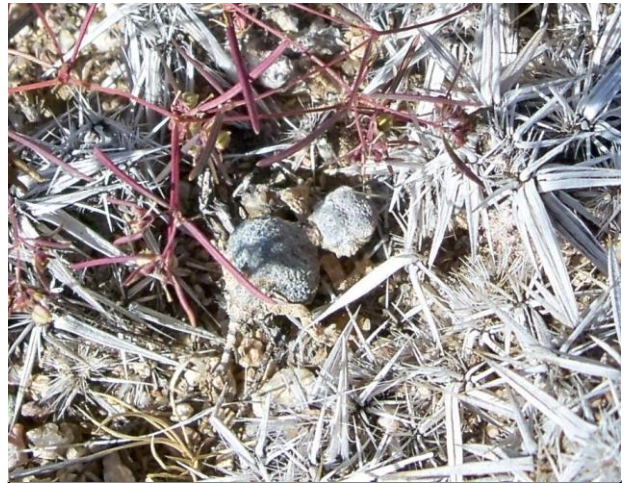
Above: an example of a find that was not in a trap. In this case a juvenile roundtail horned lizard ( Phrynosoma modestum ). This individual is surrounded by a healthy growth of cholla cactus. Nice to take a picture here, but if you want to grab the lizard, you had better wait for better conditions.