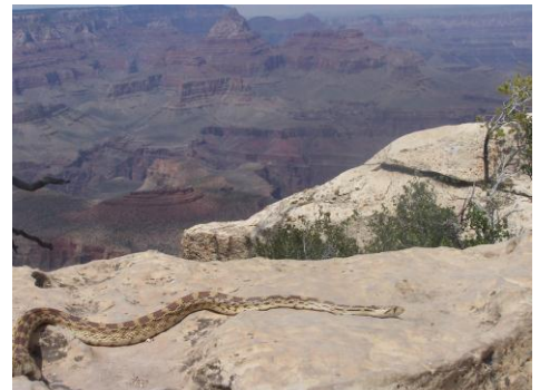
Above: The Gophersnake Nikki found at the Grand Canyon Below: The Gophersnake that Nikki found in Utah.

What was your most memorable find? We were in Utah for Father's Day and we needed to get some